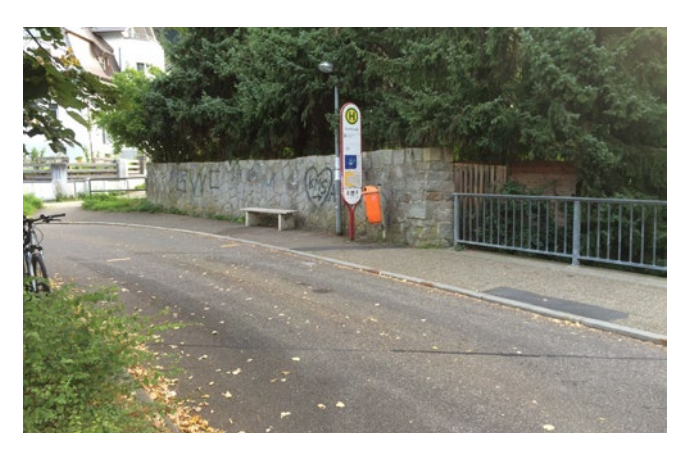
Bus stop in the street Dorfstraße

More information about the public transports in Freiburg can be found at www.vagf. de. You can consult the bus timetable and network and ask for barrier-free access. All information is available in the leaflet "barrier-free and comfortable" which you can download as PDF.