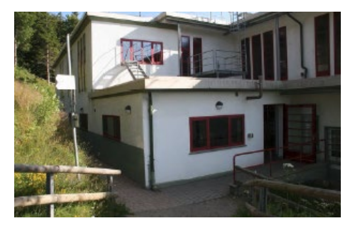
Exit area of the upper station