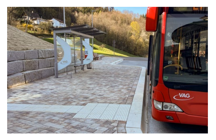
Bus stop of the Schauinsland cable car's lower station