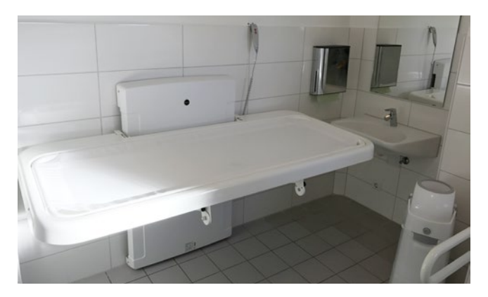
Disabled WC at the upper station

There is also a nappy bin with anti-odor function in the WC of the upper station.