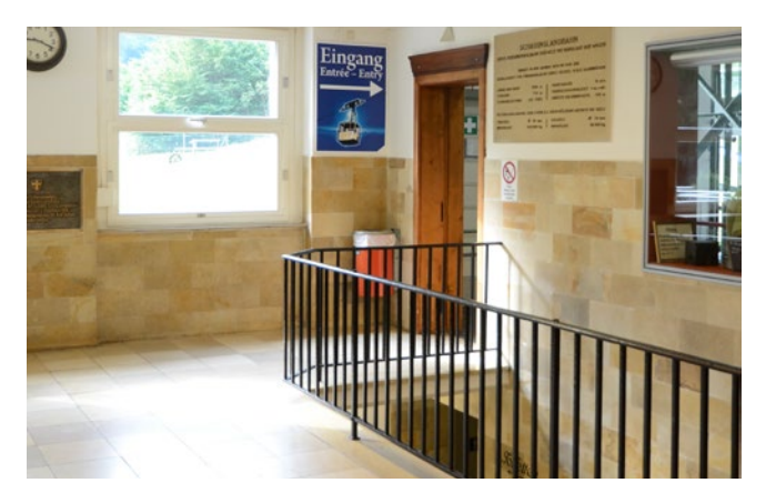
Automatic doors to the cabins