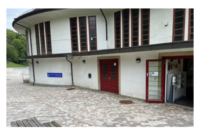
Exit of the lower station