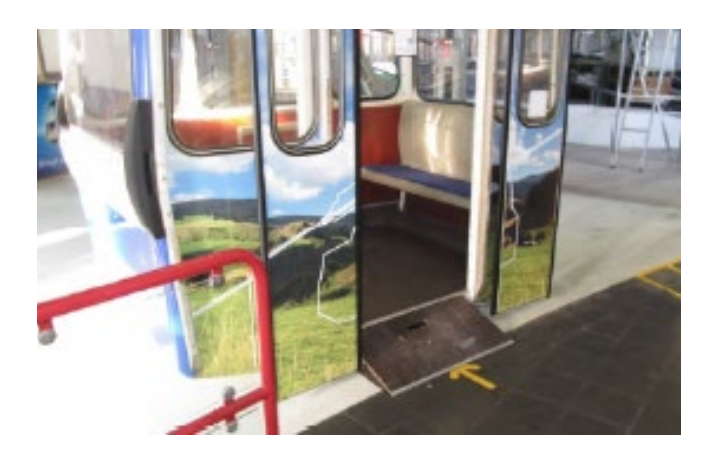
Access via a mobile ramp