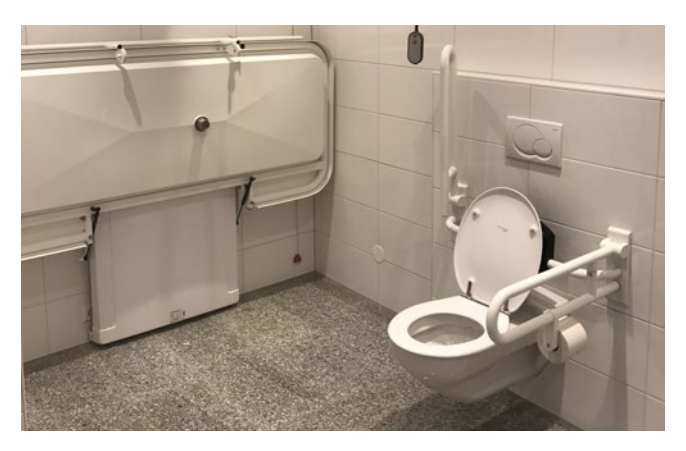
Disabled WC at the lower station

There is also a nappy bin with anti-odor function in the WC of the lower station.