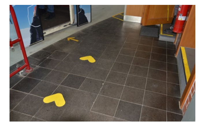
Waiting area for the access to the cabins