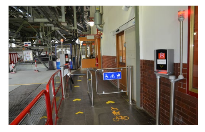
Cabin access area

When you arrive at the upper station, you have the possibility to go down with a ramp. You have enough space in front of the ramp to get it down smoothly. The distance between the ramp and the wall is 1.80 m.