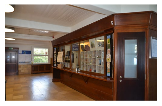
Interior space of the upper station

You can access the building via a 6 steps stairs with handrail or via a ramp. The ramp has an incline of max. 13%, it is thus possible to access the building by wheelchair or with a pushchair. Pay attention that the ramp follows an angle as you can see on the photo of the entrance of the upper station (see 1st photo under 4.1). You will find the exact dimensions on the access map for disabled.