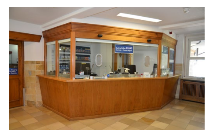
Cash counter of the lower station