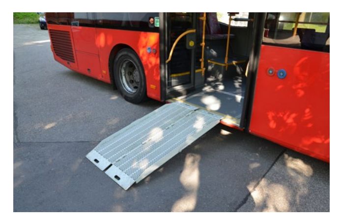
Ramp to enter and leave the bus