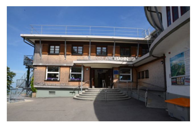
Access area of the upper station

When you are in front of the entrance to the upper station, you can see the outdoor space of the Restaurant "Die Bergstation" on your left. This outdoor area is equipped in summer with four large picnic benches and four wooden deck chairs; It is accessible without barriers. In order to access the benches without any difficulty, you may need help, as the difference in height from the ground is variable. Behind the picnic area, you can also enjoy the view on the Rhine valley without any barriers.